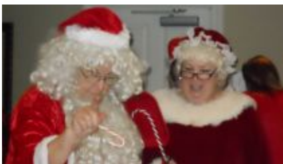
Have you been naughty or nice? Santa and Mrs. Claus joined in on the Family Christmas Party. Santa said everyone at Callaway is very nice.