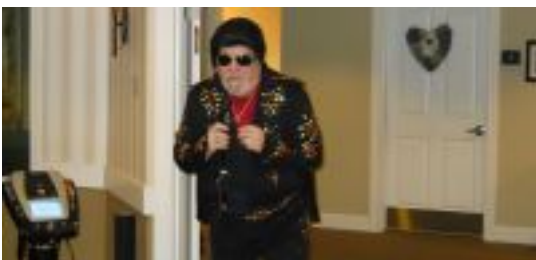
Guess who? Elvis, the birthday boy.