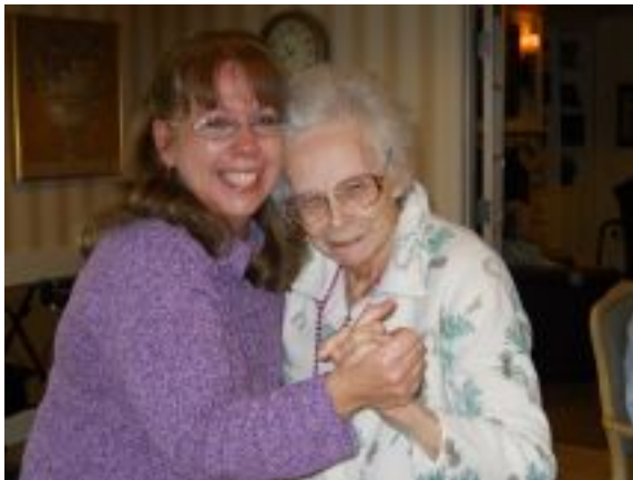
Mother and daughter dancing to the music of Elvis.