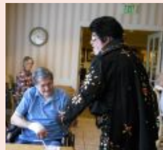
Kiss, hug or handshake, Elvis makes everyone happy!