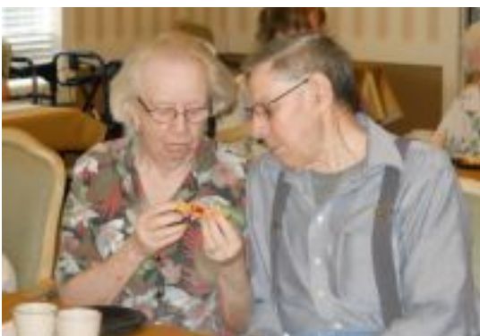
Sharing a jelly donut.