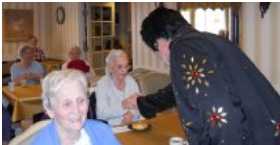
We served Elvis' favorite foods for his party—jelly donuts and peanut butter with banana sandwiches. Yum, yum. Everyone loved it!