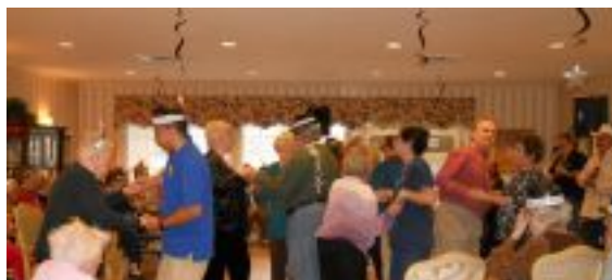
We rang in the New Year with the residents while listening to the Westernaires. Lots of dancing, great food and fun with friends and family.