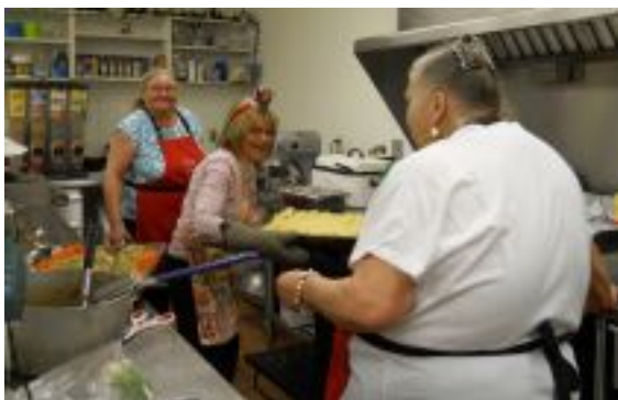
Our wonderful staff fixing a fabulous meal.